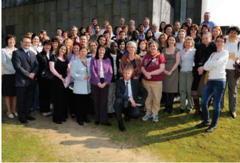
We are looking forward meeting you in Haltern!