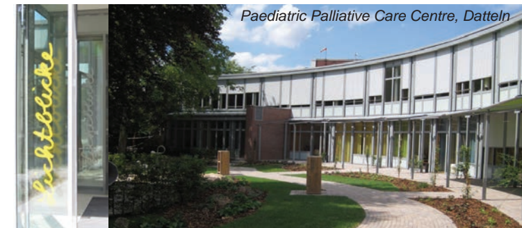
Paediatric Palliative Care Centre, Datteln

Paediatric Palliative Care Centre Children's Hospital Datteln Witten/Herdecke University Dr.-Friedrich-Steiner-Str. 5 45711 Datteln, Germany www.kinderpalliativzentrum.de